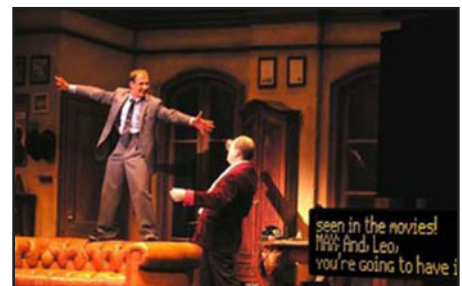
Closed captioning is provided for an audience at a live theater show.