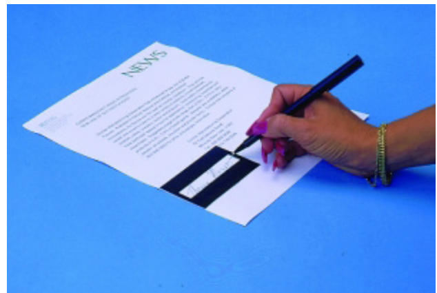
Figure 3: Signature guide